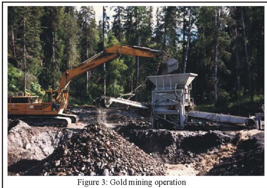
Figure 3: Gold mining operation

From the turn of the last century until World War II, Hope Mining Company’s claims were mined using hydraulic equipment. Hydraulic mining utilizes large, high-pressure water nozzles to move and wash the placer deposits and to stack the tailings. In the years after World War II,